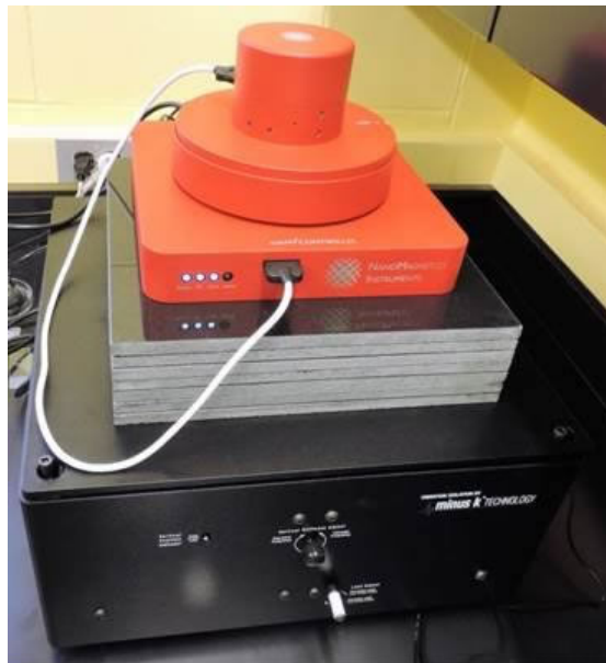
ezAFM+ supported by Negative-Stiffness vibration isolation.

Since the release of the first commercial atomic force microscope (AFM) about 30 years ago, technology advances have steadily been implemented to improve their performance. Now, the most recent advance in ambient-temperature AFMs is making them more compact, portable and user-friendly, which is enabled by Negative-Stiffness vibration isolation.