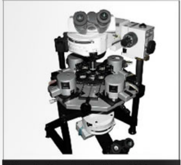
Minus K – Nanonics MultiView 4000 MultiProbe system for scanning probe microscopy permits full integration with optical techniques such as Raman using negative-stiffness vibration isolation.